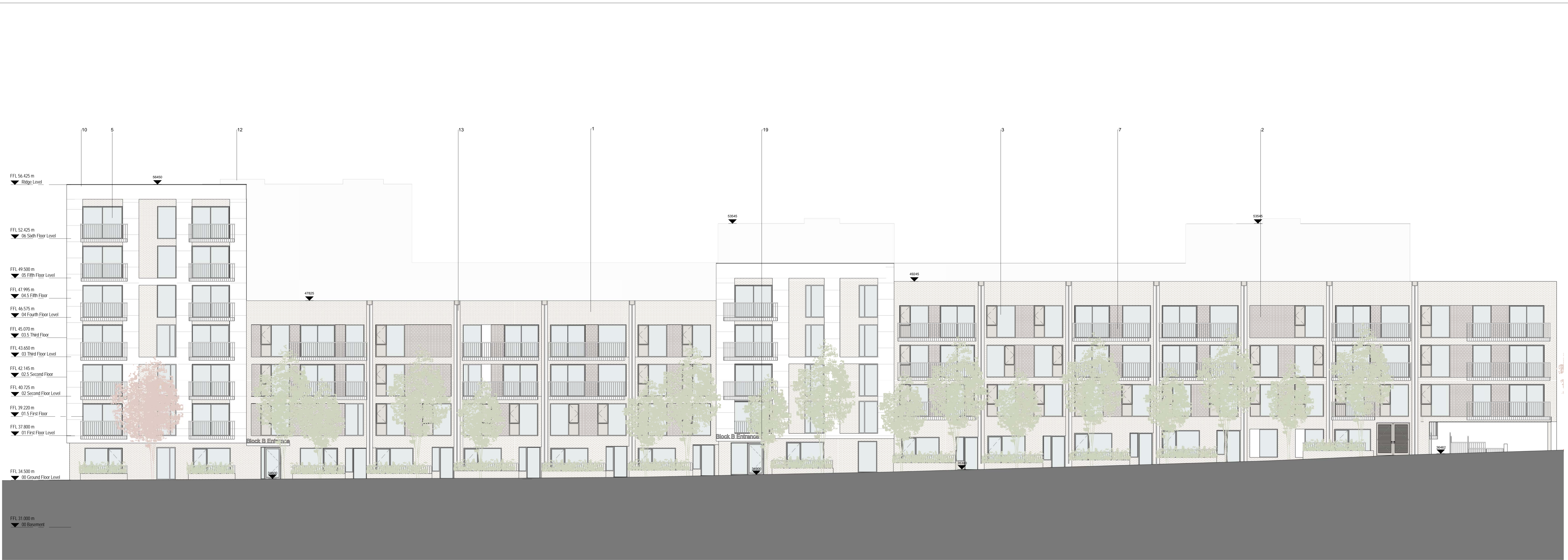
1 Elevation NW 1 : 100